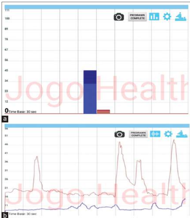
Figure 3: (a) Baseline Jogo electromyography Biofeedback note weak abdominal muscles: TrA (red) 3 mV and pelvic floor tightness: PR (blue) 45 mV. Post Jogo electromyography Biofeedback therapy: Note an increase in strength of abdominal muscles: TrA (red) (48 mV) and relaxation of pelvic floor: PR (blue) (9-10 mV)