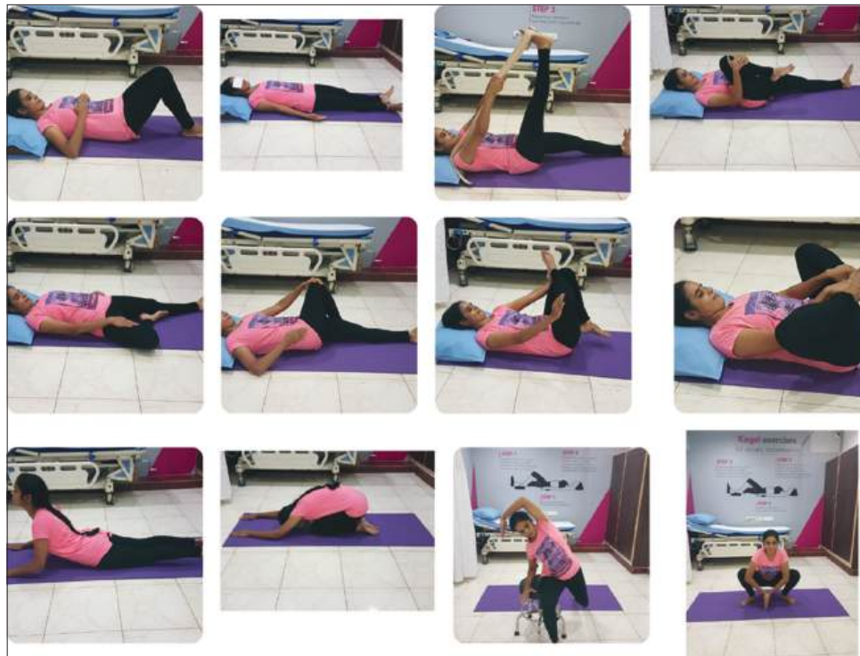
Figure 1: Pelvic floor relaxation exercises. Pelvic floor relaxation/stretch exercises. Top Row (left to right): Deep Breathing Exercises, Savasana (total body relaxation), hamstrings stretch with Pelvic Floor Muscles relaxation), gluteal stretch with Pelvic Floor Muscles relaxation). Middle Row (left to right): Right Adductors, Right Abductors, Piriformis, and both adductors stretch with Pelvic Floor Muscles Relaxation. Bottom Row (left to right): Abdominal, Spinal Extensor, Side Flexors, and Inner thigh Stretch with Pelvic Floor Muscle Relaxation